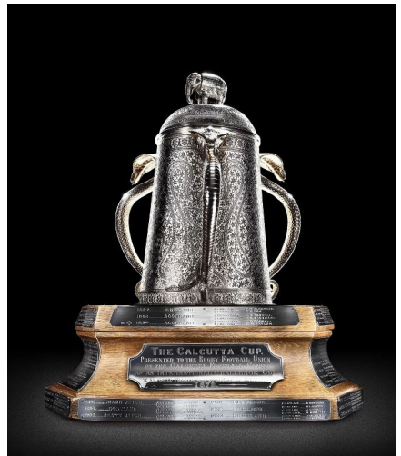
The Calcutta Cup.

(Following an 'incident' with the original cup, a new replica was made.)